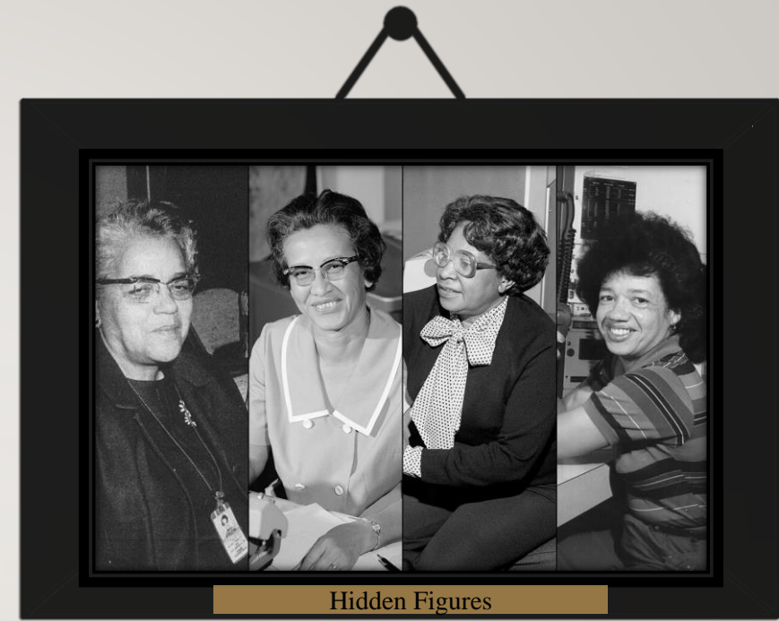
L to R: Dorothy Vaughan, Katherine Johnson, Mary W. Jackson, and Christine Darden are four African American female mathematicians whose complex calculations helped NASA win the Space Race.

“Diversity is being invited to the party. Inclusion is being asked to dance.”