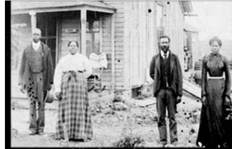
The Ocoee Massacre, on election day 1920 over 50 to 60 African Americans were killed when one African American man attempted to vote.

and complete the survey by Friday, October 2, 2020. Only one proposal per person will be considered. If you have any questions, contact Dr. Bernadette Kelley at Bernadette.kelley@famu.edu or (850) 599-3692.